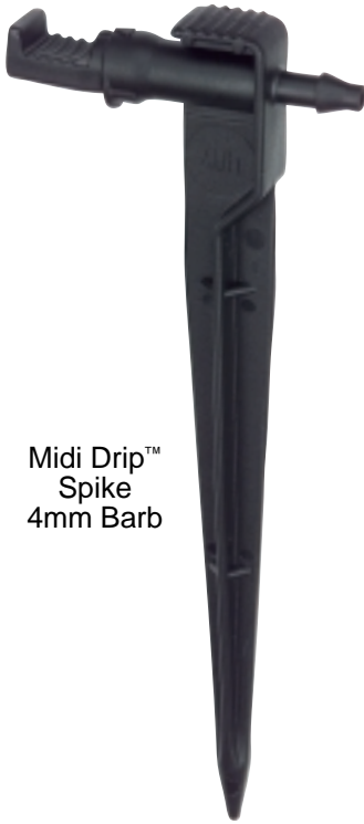
Midi Drip™ Spike 4mm Barb