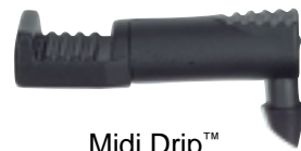
Midi Drip™ 4 mm Barb

Economical and precise watering of individual plants and trees with stable positioning of emitters in tubing or with spike.